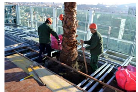
The large palm trees were positioned within the planters by joining forces.