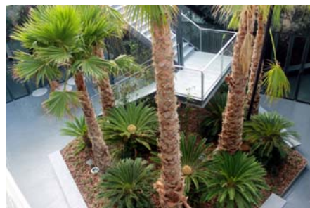
The open vertical garden with its 300 palm trees and other tropical plants extends over the full height of the building, from its entrance, over the small balconies and landings, up to the roofs at about 100 meters of height.