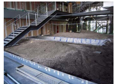
The green roof system build-up "Roof Garden" was applied as a substructure within the planters.