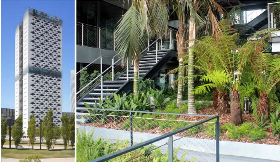
Even the hotel's facade with its palm-shaped window openings arouses the observer's interest.