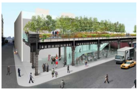
Today's appearance very much resembles this project outline (2003).