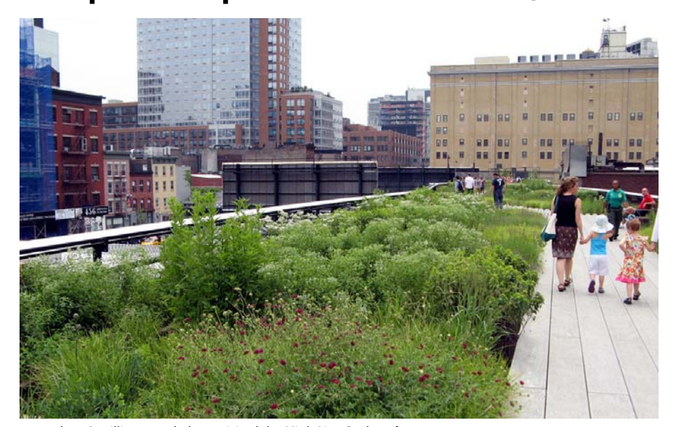
More than 3 million people have visited the High Line Park so far.