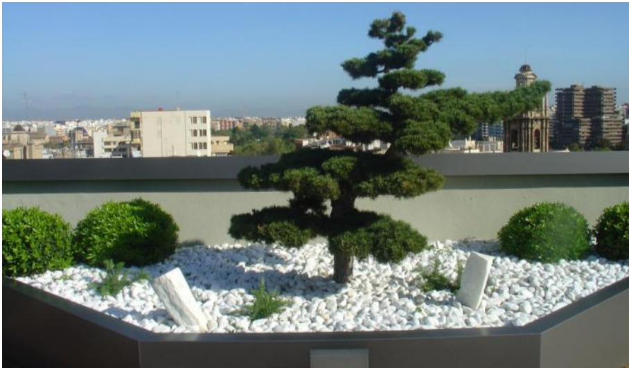
The plant beds enclose the roof terrace. The view spreads over the picturesque old town to the concrete walls of newer design.