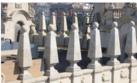
The festive roof terrace looks like a cathedral from outside.