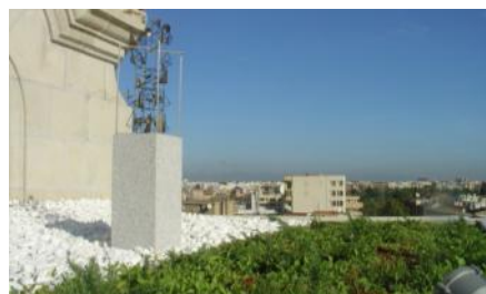
Symbol for modern art in line with traditional architecture.