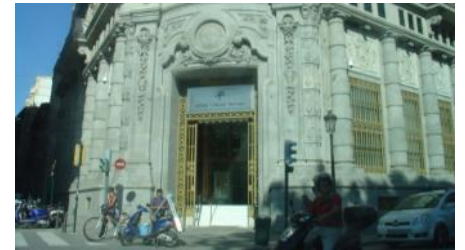
The over 100 years old building.

entire utilized roof area and serves as a boundary and fall protection. The walk in area was built with noble wooden planking on pedestals. The plant beds include a ZinCo system build-up which together with the drip irrigation contributes to an economical water consumption.