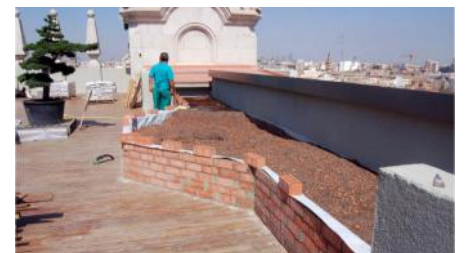
The plant beds enclosed by a wall accommodate the system build-up "Roof Garden".