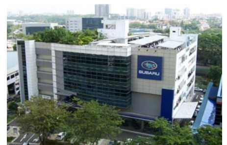
View from a neighbouring building onto the roof of Subaru headquarters.

the circuit, such as humps, rocks, a sand trail and even a waterfall. The all-wheel drive test track was installed on top of the heavy duty drainage element Elastodrain® EL 202, which offers excellent protection to the waterproofing membrane and even caters for wild cornering. Besides, it provides for perfect drainage, most important during heavy tropical rain.