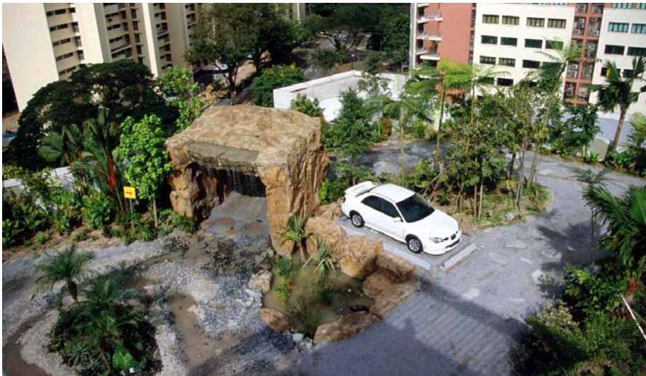
All-wheel driving pleasure on the Subaru roof top in Singapore.