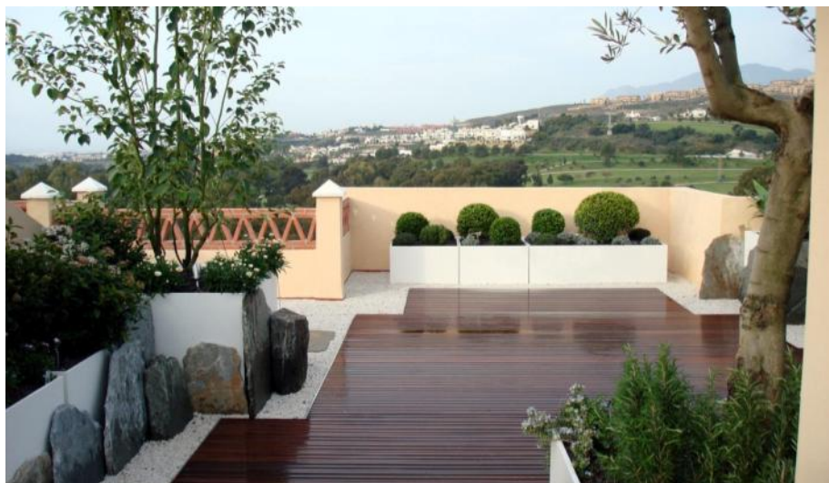
The exclusive roof garden is located amidst impressive scenery.