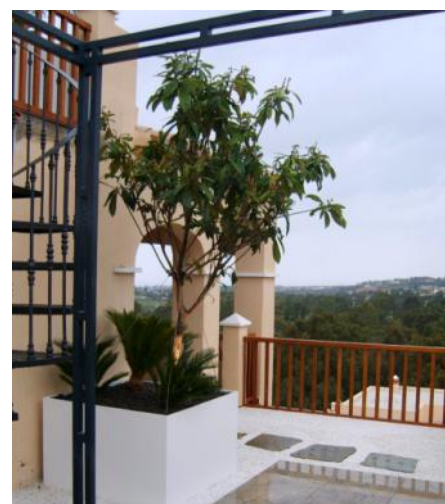
The different materials for the large terrace consisting of timber floor boards, granite and quartzite slabs combined with the planting areas make this roof garden to an exceptional Mediterranean lounge.