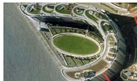
Aerial view of New Providence Wharf building in London.

to provide sanctuary and habitat for the rare Black Redstart bird. This vegetation was installed onto the roof in pre-cultivated mats to ensure success in this very windy environment. The central courtyard is surrounded by the building and is also located on a roof. In this case above a large underground car park. An oval lawn at the centre of this area is surrounded by a walkway bench seating and serpentine water feature, complete with jetty-like balconies extending from the ground floor apartments.