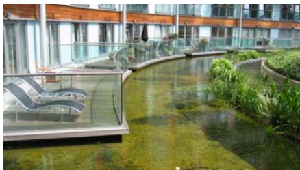
The balconies of the ground floor flats jut out over the artificial watercourse.