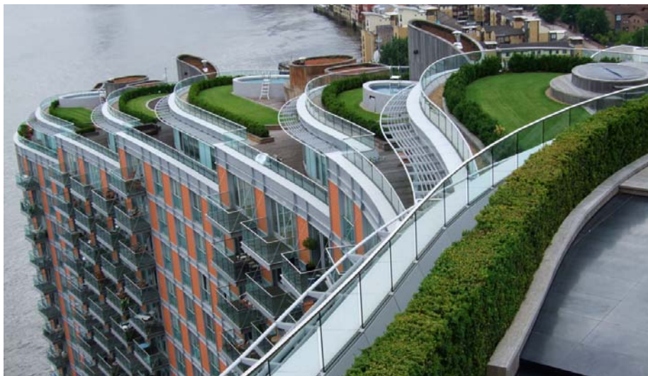
Each floor was vegetated with lawn and contains a small swimming pool.