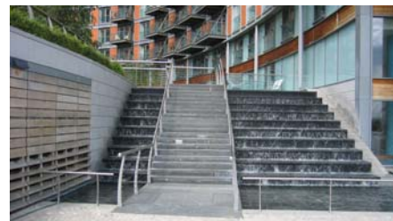
Water flows down the stairs like a waterfall.