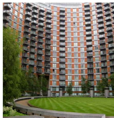
The inner courtyard with park benches above the underground garage.