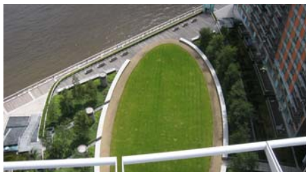
View from the top of the New Providence Wharf onto the inner courtyard covering an underground parking.