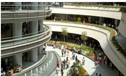
The Kanyon Levent Centre - an experience for fans of shopping, gourmet and lifestyle.