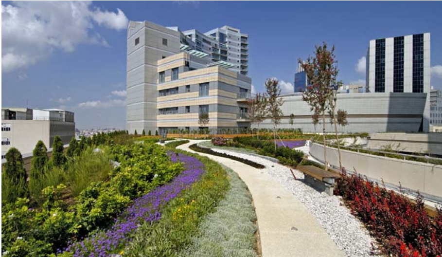
The Kanyon Shopping Centre is located in the business district of Istanbul.