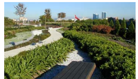
Benches have been placed on the roof.