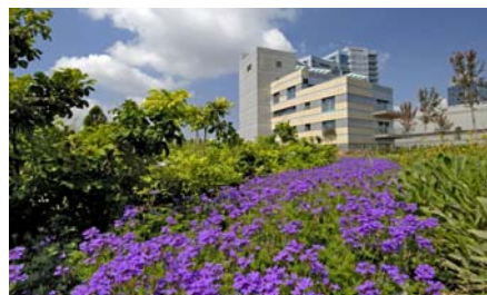
A colorful blooming landscaped roof in the heart of a million-metropole.