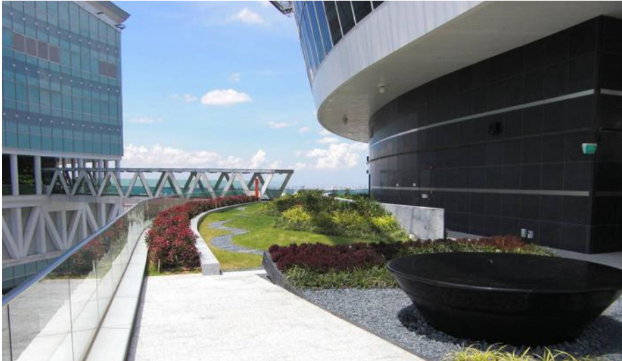
The Singapore Fusionopolis complex is even planted on the 24 th floor.