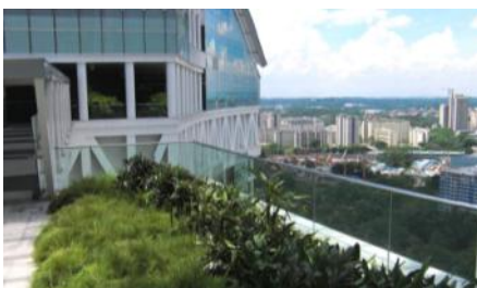
A garden floating in the sky.