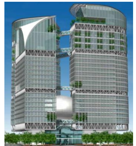
The three Fusionopolis towers are connected by skybridges.

practical use for the occupants. The main gardens are situated on the crucial floors with the transitions to the other towers. These roof gardens have a dense vegetation comprising trees with heights of up to 5 metres and shrubs of up to 1.5 metres. Furthermore, many small but visible gardens were built on balconies in the outdoor areas of all of-fices. They were spread over the total height of the complex.