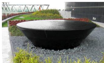
Water basin on the 22 nd floor in an exposed position.