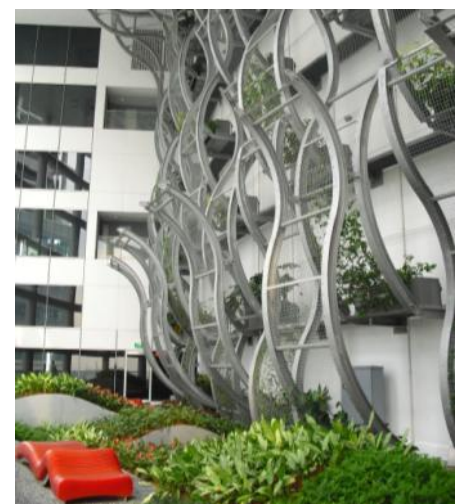
Very impressive type of vertical greenery.