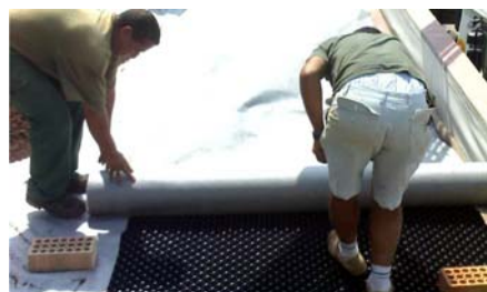
The Filter Sheet SF was placed on the drainage element Floradrain® FD 40-E.