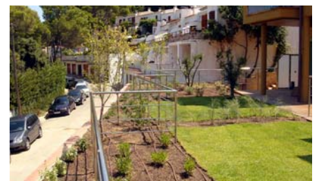
The automatic irrigation system was installed on top of the System Substrate.