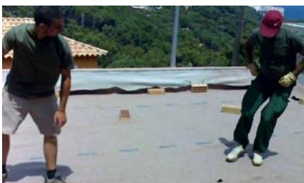
The already installed Protection Mat SSM 45.