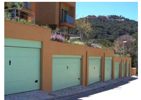
The beautiful flowering plants after about one year.