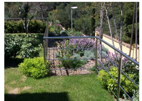
The stainless steel rail protects against falls from the accessible garage roof area.