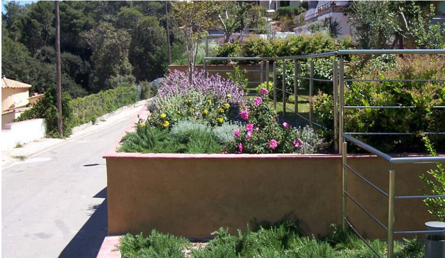
The garages with green roofs with a stainless steel rail in Sa Tuna-Begur.