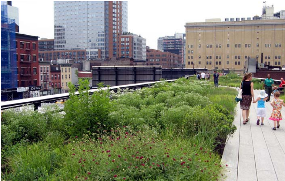
More than 3 million people have visited the High Line Park so far.