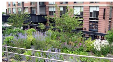
More than 200 different plant species were used.