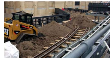
The average substrate depth is 450 mm.