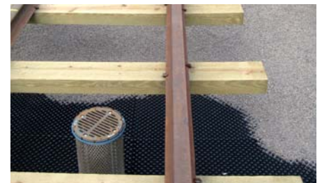
Installation of the green roof build-up under the rails. The drainage layer consists of infilled Floradrain® elements.