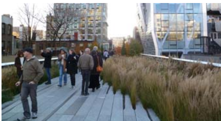
The High Line Park has achieved the "IGRA Green Roof Leadership Award 2010".