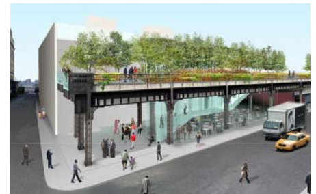
Today's appearance very much resembles this project outline (2003).