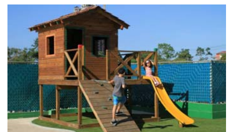
The children have also been thought of, thus a playground was built on the roof.