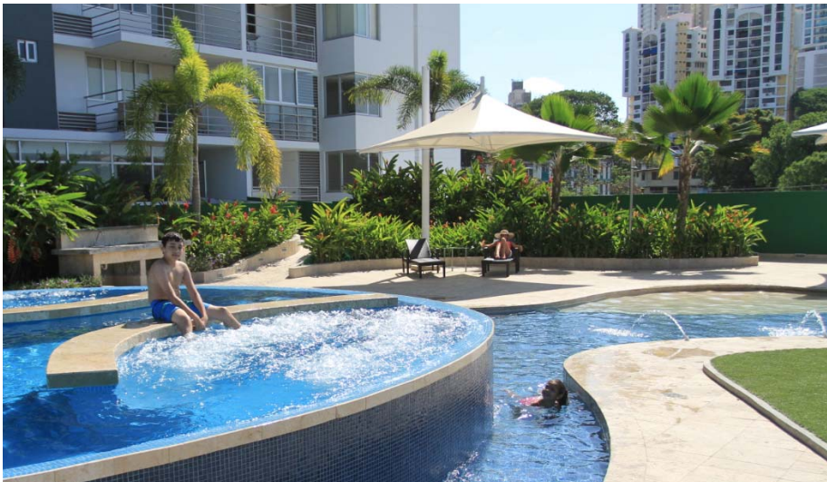
This complex roof garden was created on top of a parking garage.