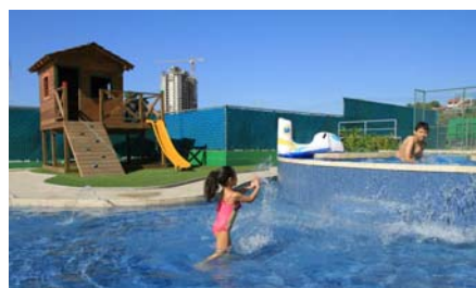
Since the completion of the roof garden it has been used frequently by the residents of the apartments.