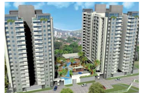
This rendering shows the planned roof garden, which is to connect the two apartment towers. The roof can be accessed directly from both towers.

FD 40 and the System Filter SF were installed on the entire roof area, apart from the pool area. The System Substrate "Roof Garden" was applied within the planting areas. The substrate depth varies according to the height and type of vegetation. The selection of species was made not only according to the visual appealing but also to climatic conditions.