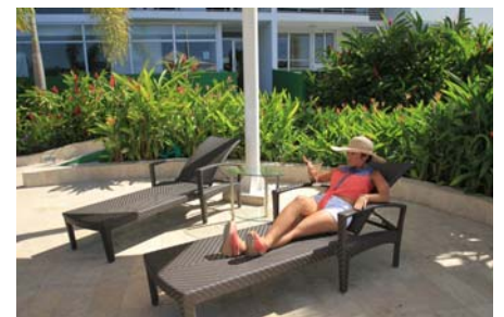
Despite the heavily frequented street running right in front of the building, the roof garden offers a kind of "haven of peace".