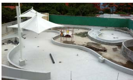
The future pool area is clearly recognizable only shortly after completion of the waterproofing works.