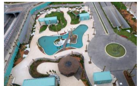
The spectacular view from one of the hotel rooms shows clearly the architectural concept of the park with its circle elements and curved lines.