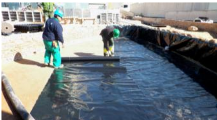
In the planting areas demarcated by stone walls the ZinCo Root Barrier WSF 40 has been laid first.