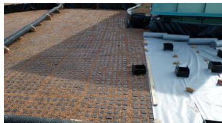
The filled drainage and water storage element Floradrain® FD 60 was covered with the filter Sheet SF.