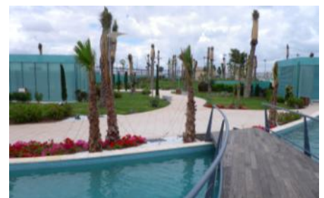
The curved wooden bridge leads the visitors to the island within the water basin.