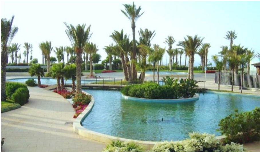
The park resembles an oasis which allows for visitors to walk through.