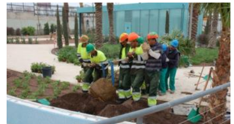
The palm trees with a height of up to 8 m, some of them even with multiple stems, were planted by joining forces.