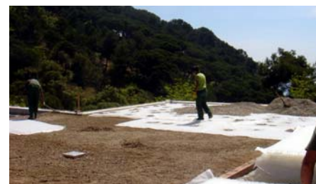
During application of the graveled area on top of the Filter Sheet PV.