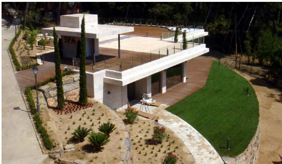
The new spa & wellness area received a new building separated from the hotel.