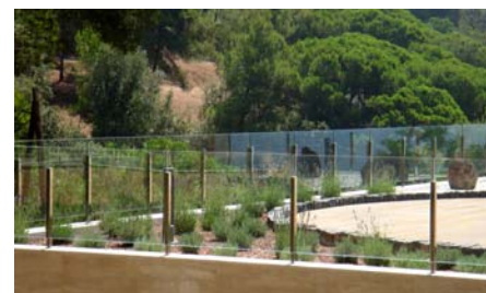
As a fall protection a railing was attached with transparent infill.

events can be performed in front of a delightful and natural scenery. The basis to this were the ZinCo system build-ups with Floradrain® FD 25-E below the hard landscapes and Floradrain® FD 40-E below the green areas. The planted beds received an additional drip irrigation.