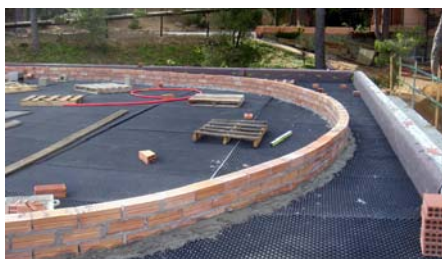
Floradrain® FD 40-E is used as permanent formwork for the separation between hard surface and garden.