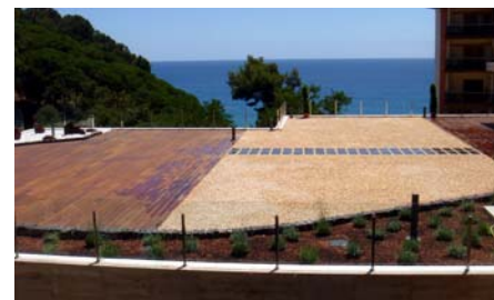
The roof surface was divided into two areas. The left side received wooden decking and the right side was filled with ornamental gravel.