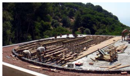
During the assembly of the "IPE" - hardwood flooring, on which 'events', dinners and festivals are planned.