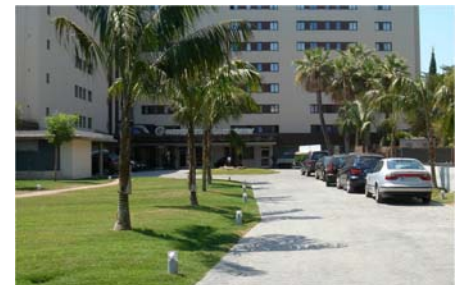
The same view after completion.