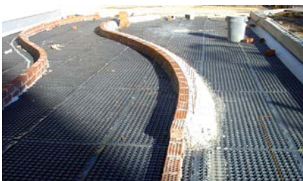
Curb between driveway and green zone.