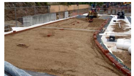
Applying the base layer.