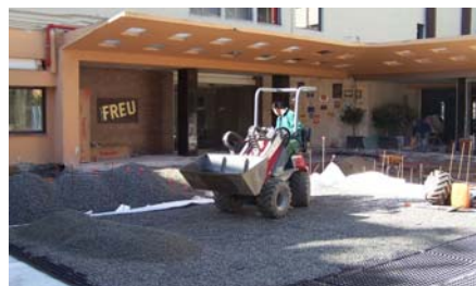
Application of gravel with a wheel loader.