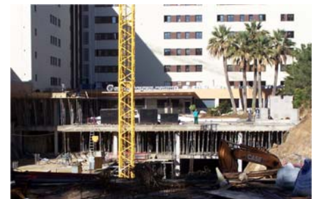
The underground garage under construction.

dimensioned to be created for the heavy load traffic whilst integrating the green areas with the high palm trees. The palm species "Howea forsteriana" grows up to 15 m in height. The remaining green roof area consists of lawn which is irrigated by an automatic system.