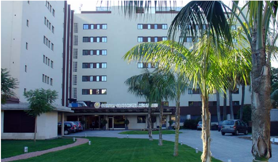
Hotel access for minibuses and cars on top of a two storey deep underground garage.