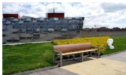
Benches set along the walkways invite the visitors to rest.