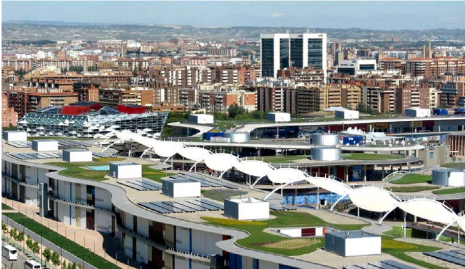
More than 70.000 m 2 of roof area were supplied with lawn, flowerbeds, party areas and walkways for the visitors of the Expo.