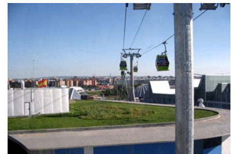
The complete area could be seen from the cable car.