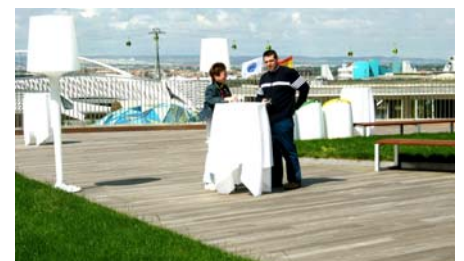
Lighting and tables complete the appearance of the roof landscape.