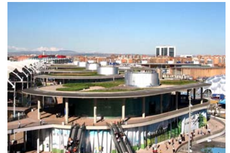
The vegetation on the 10m high roofs is adapted to the Spanish climate.