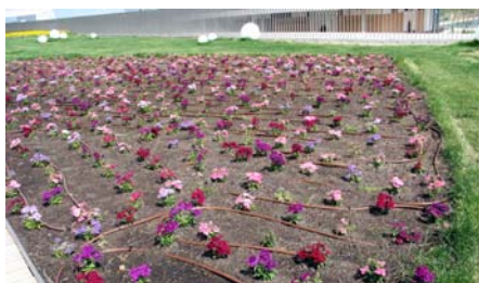
A drip irrigation was installed in the flowerbeds.