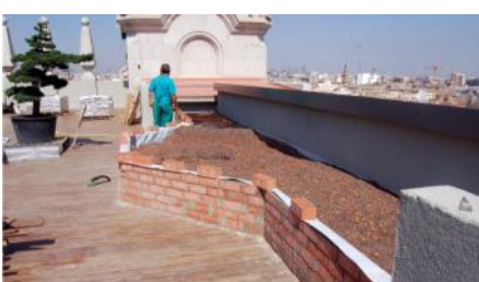
The plant beds enclosed by a wall accommodate