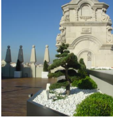
The walls of the plant beds are covered with grey coated metal.