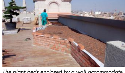
the system build-up "Roof Garden"