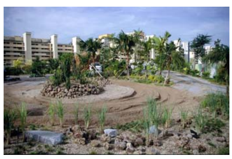
The sand track allows a smooth gliding. Rocks, wooden sleepers, etc. were also integrated within the circuit.