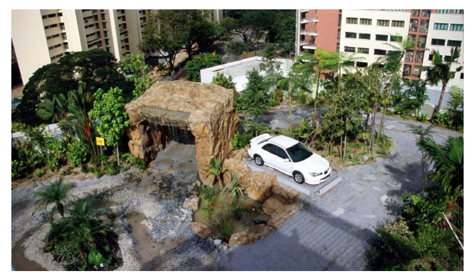
All-wheel driving pleasure on the Subaru roof top in Singapore.