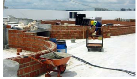
Features such as ramps and bridges were built on top of the protection and drainage layer.