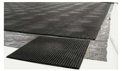
\mathsf{Elastodrain}^{\circledast} EL 202 was fully laid above the Slip Sheet TGF 20.