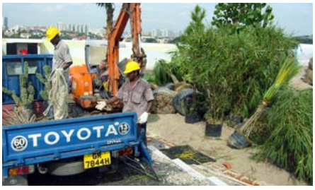
Local palm trees were planted in a 1,20 m deep substrate layer.