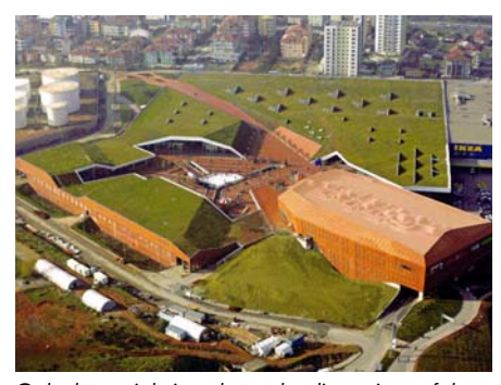
Only the aerial view shows the dimensions of the Meydan-Centre.