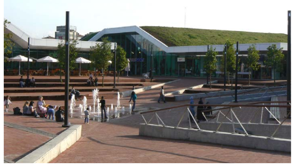
The central point of Shopping Square Meydan is a large piazza.