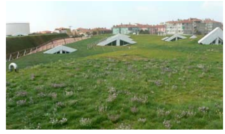
Most of the roof area is covered with a natural meadow.