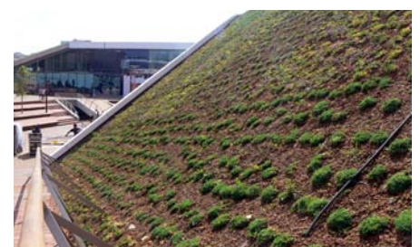
The steep roof with the different species of Sedum.