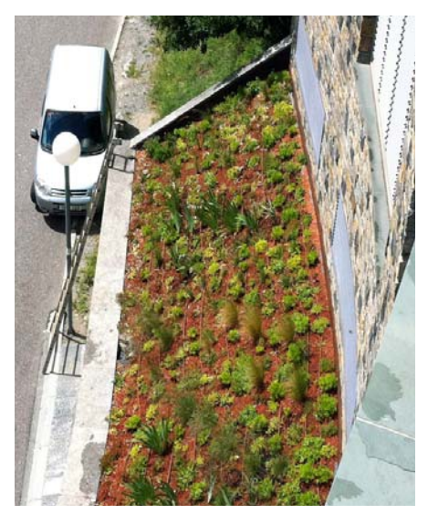
Despite the alpine mountains of Andorra, with their frequent rainfalls, the roof gardeners decided to install a drip irrigation.