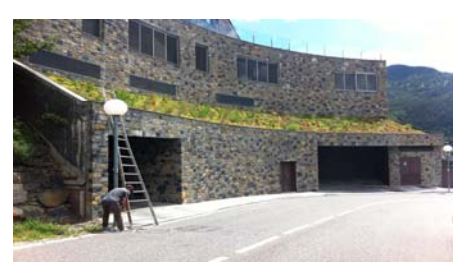
The green roof with its plant diversity mitigates the severity of the bare stone facades.