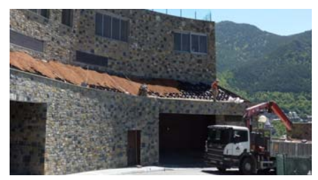
The difficulty for the roof gardeners was the professional handling of shear forces on this steep roof area