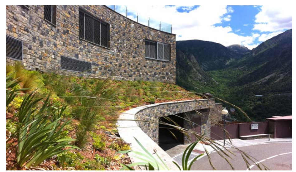
Residential complex built in the Catalan-Pyrenean architecture style in the resort of Escaldes-Engordany in the Pyrenees.