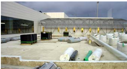
Protection mat, drainage elements and filter sheet are ready for installation.