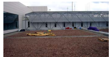
The roof area just after the application of substrate with BigBags.