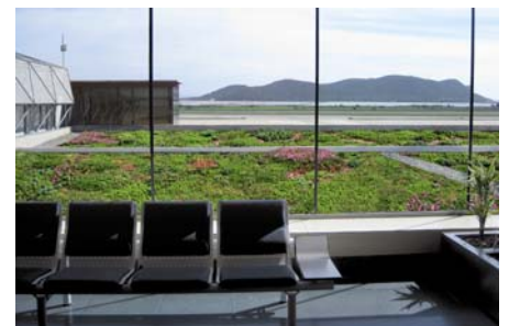
View from the waiting hall on the large-scale planting.