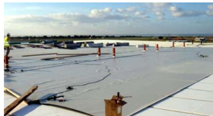
Preliminary work on the roof area to be vegetated.