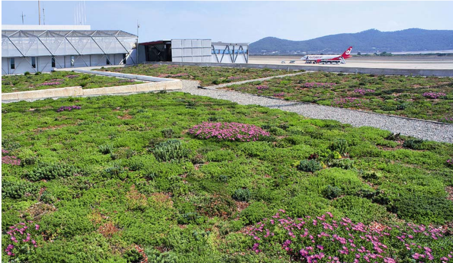
Partial view of the large-scale extensive planting.