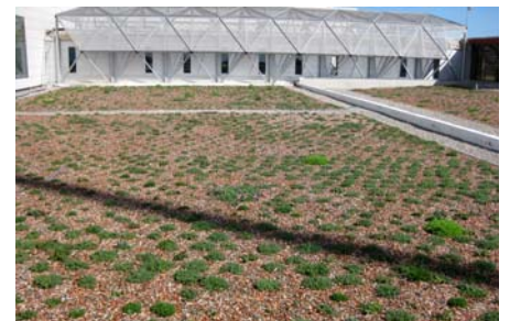
The roof area a few months after the plug plants have been planted.