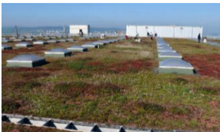
The Roof during maintenance work in September 2010.