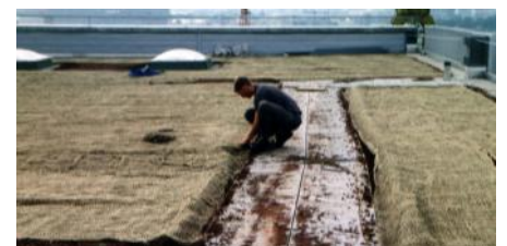
Installation of the Jute Anti-Erosion Net JEG on the System Substrate.