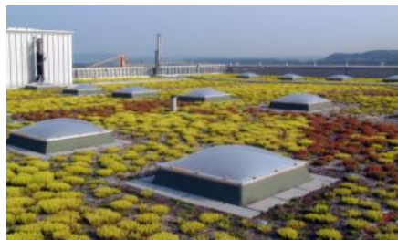
The Roof of the parking garage in June 2003 (in the second growing season).