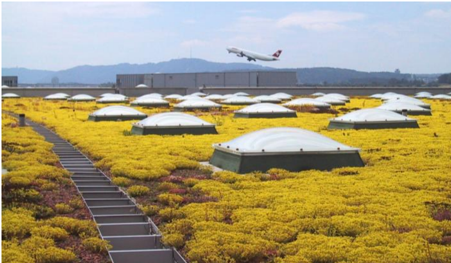
The roof of the parking garage in full bloom. (photo July 2004).