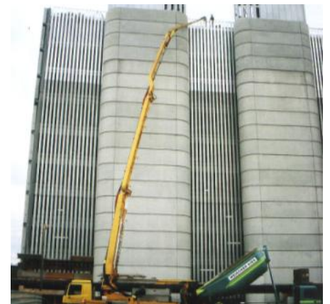
Blowing of the substrate to the roof with a special lorry and a mobile pump.