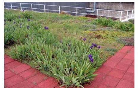
The terrace on the green roof was installed for visitors.