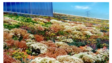
The roof is almost fully covered by a carpet of Sedums.