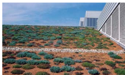
The horizontal gravel strips are clearly visible, under which the roof drainage is hidden.