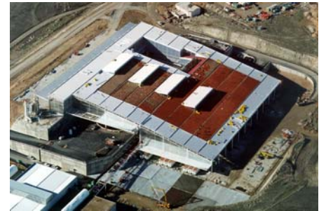
Aerial view of the Recycling Plant of Vertresa.

suited to this project. In Germany, where the climate is more moderate, extensive green roofs are usually not irrigated; whereas, Madrid has a much drier climate and the planners, not wishing to take risks, designed the green roof with an irrigation system. It is anticipated that the system will only be operated for a few days each year.