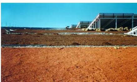
The Zincolit® has been spread over the roof and is being covered by the Anti-Erosion Net.