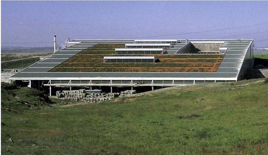
The green roof helps this large building into the surrounding landscape.